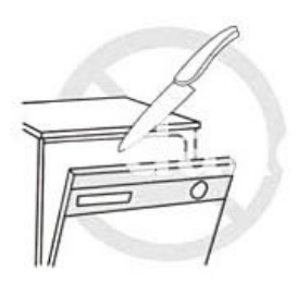
Do not use dishwasher safe