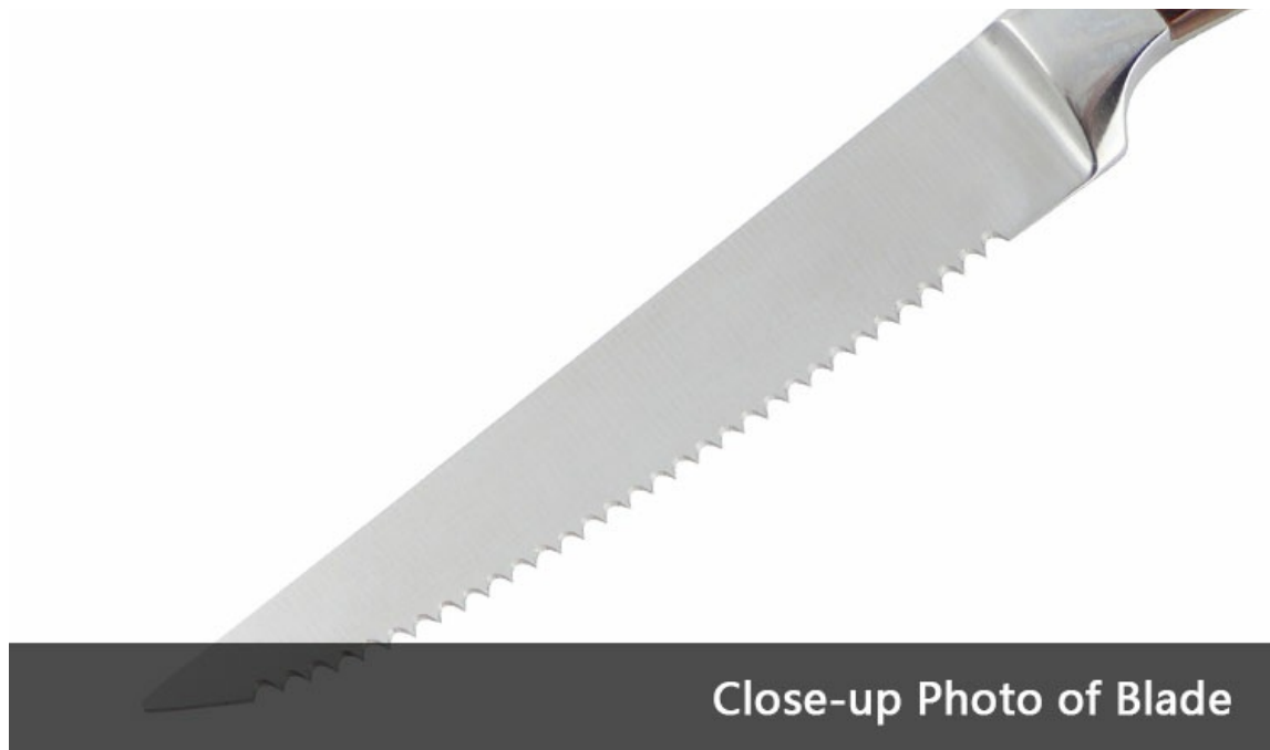
Close-up Photo of Blade

With beautiful designed handle and comfortable to hold