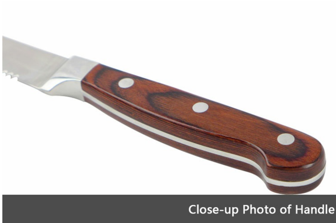
Close-up Photo of Handle

With beautiful designed handle and comfortable to hold