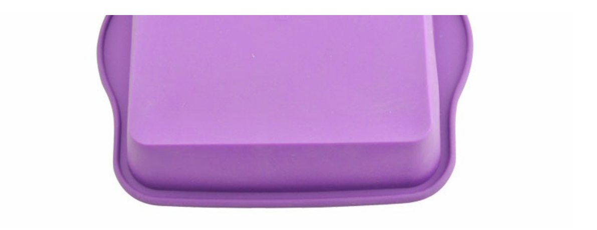
Silicone material, non-stick and easy to demold.Eco-friendly, Low-Carbon, Recycled.