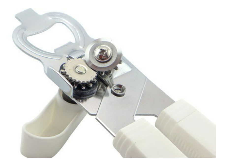
High-end and elegant appearance design, convenient and durable, selected high-quality stainless steel materials, makes products more perfect!