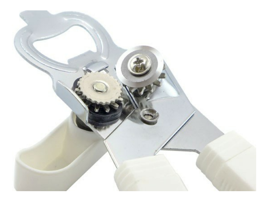
Ergonomic design, plastic rotating handle, non-slip, touch feeling is comfortable, simple and easy to use.