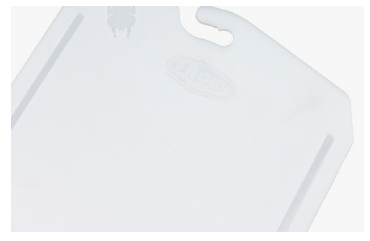
Anti-overflow Tank Humanized water-conductive design prevents juice spilling when cutting succulent food.