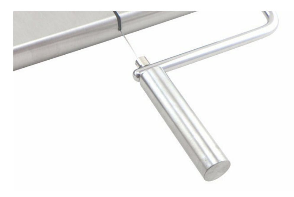
Five cutting lines can replace the tangent component when loosen or tighten the handle.