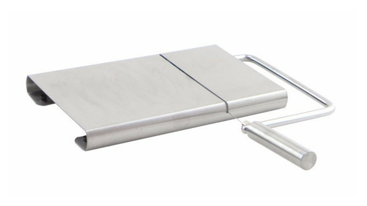
304 stainless steel cutting wire, tough and sharp so that it's convenient when using.

Smooth cutting, surface platform integral better, exquisite touch.