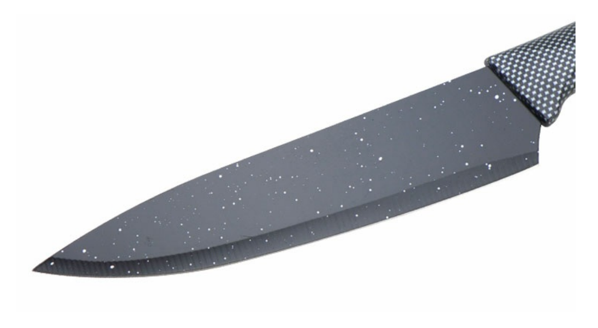
With beautiful designed handle and comfortable to hold.