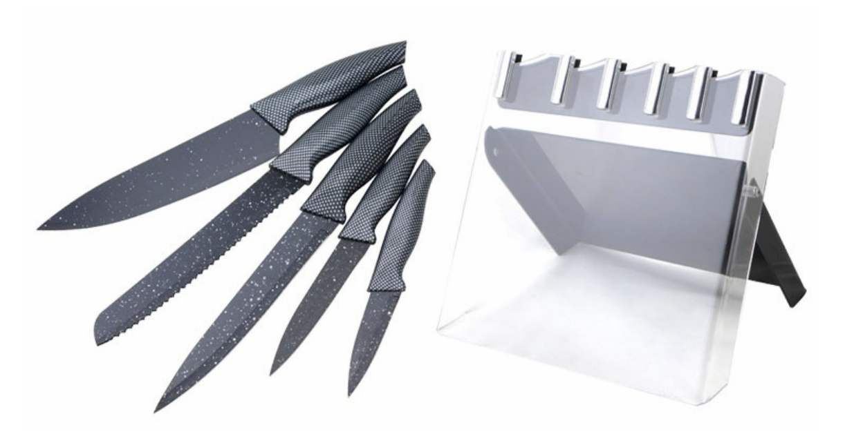
Using stainless steel with painting in the surface.