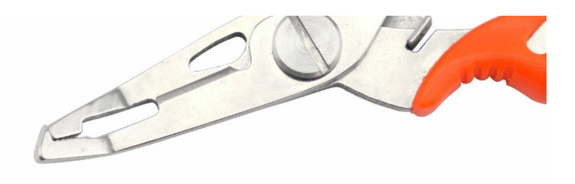
Placing the spring inside, big stretch ,easily and saving energy.