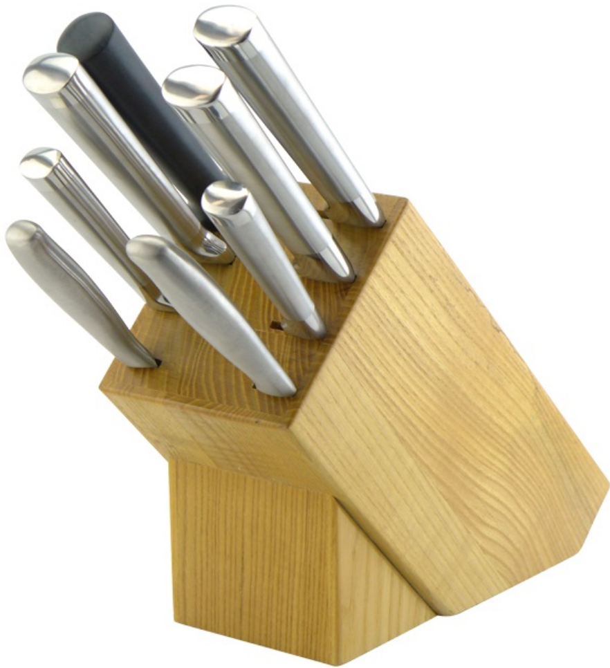
The picture is just for reference, and the knives are not included.